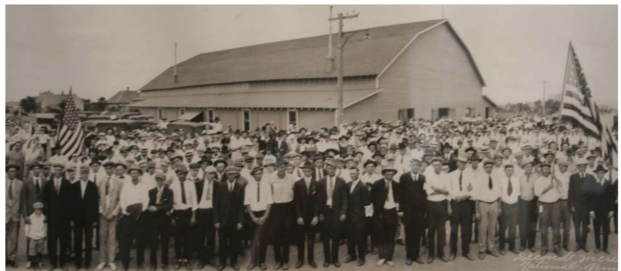
Tillman County sending young men off to training for World War I (Community Auditorium, background).