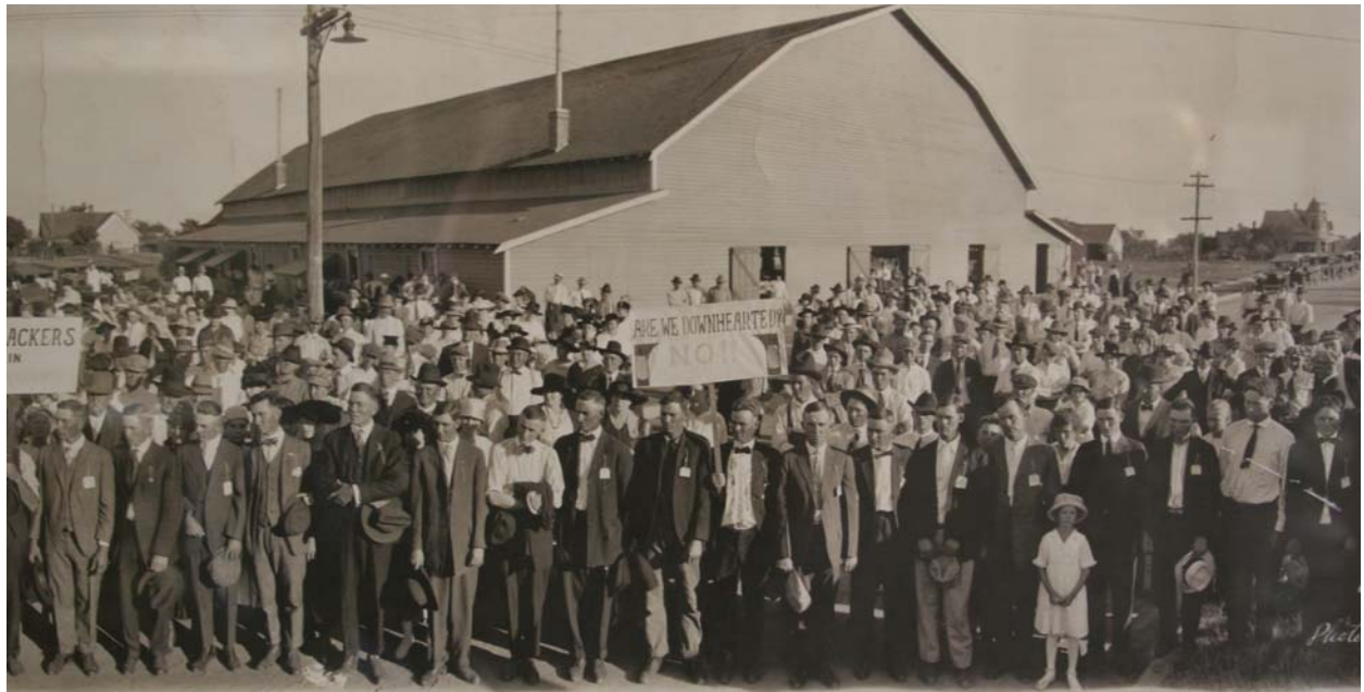
WW I war bond rally in front of Frederick's Community Auditorium, circa 1917