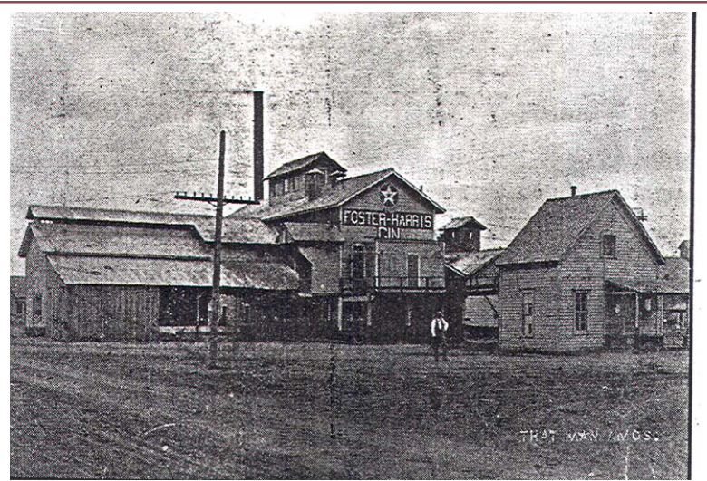
Foster-Harris Cotton Gin, North 8th in Frederick

"In addition, the company furnishes power to light the streets of the city. At the present time a system of street lighting is