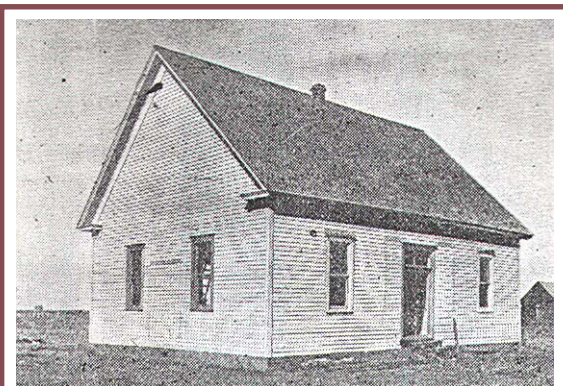
Loveland Baptist Church, 1916