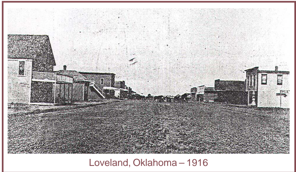
Loveland, Oklahoma – 1916

During Tillman County's first decades many communities and small towns sprang up, each with hopes of becoming a prosperous residential and commercial center. Many of those communities failed to prosper and today are only distant memories.